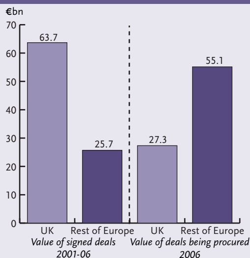
Chart 3 Trends in PFI in UK and PPP in Europe