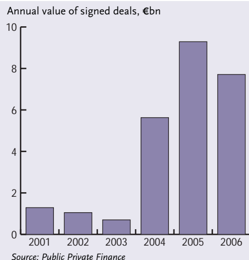
Table 5 PPP in Europe